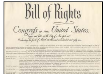
Bill of Rights Institute to conduct workshop on September 11th

A seven-unit teacher's guide, "Being an American: Exploring the Ideals that Unite Us," will be given to each participant; it contains core lesson plans and a variety of activities to help students understand the meaning and responsibilities of citizenship while helping them develop their reading, writing, and critical thinking skills. Units include: the Declaration of Independence , U. S. Constitution ,