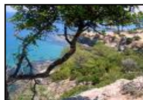
...from the beautiful Mediterranean island of Cyprus

From JD: "We just arrived in Cyprus last night after two days in Istanbul. There we saw a great many sights for being so rushed. I bought a Turkish prayer rug and we ate fresh fish for lunch caught right from the Bosphorus. Topaki Palace is better than any European castle I have ever seen (and I have seen my share of those!).